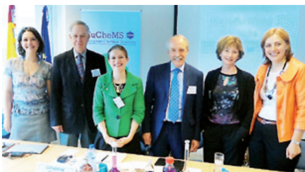
(Re)searching for Jobs Speakers