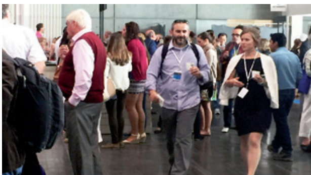
18 th EuroAnalysis, September 2015, Bordeaux