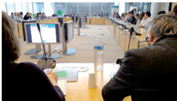
Audience at Integrating CO 2 in the Value Chain