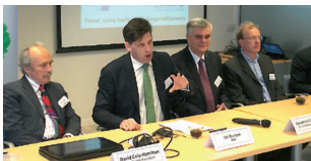
Speakers from Protecting Endangered Elements