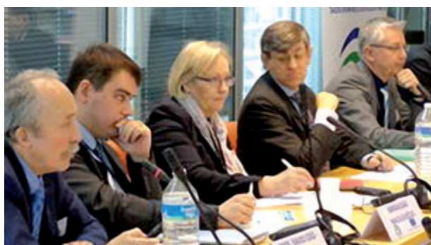
Panel of Integrating CO 2 in the Value Chain