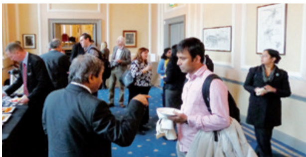
Networking Cocktail at Zero Carbon Energy – The Future, Edinburgh

The workshop was co-organised with the European Parliament Intergroup on Climate Change, Biodiversity and Sustainable Development and brought together European policy-makers, the chemical sector, the academic world and civil society in order to discuss the opportunities of turning waste into fuels, basic chemicals, polymers, and even fine chemicals and pharmaceuticals. More on this workshop can be found at http://www.euchems.eu/?p=667 .